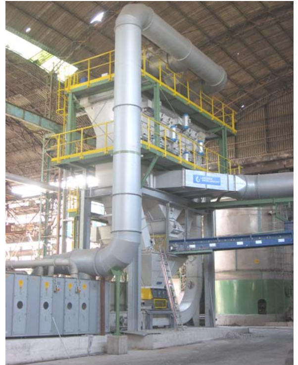
Reject - Drying for 2000 kg/h

The disposal costs of the screen rejects/fiber sludge discharged from the pulper compactor or press are therefore reduced in inverse proportion to the dry content.