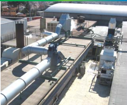
Heat recovery, Exhaust gas from the gas turbine